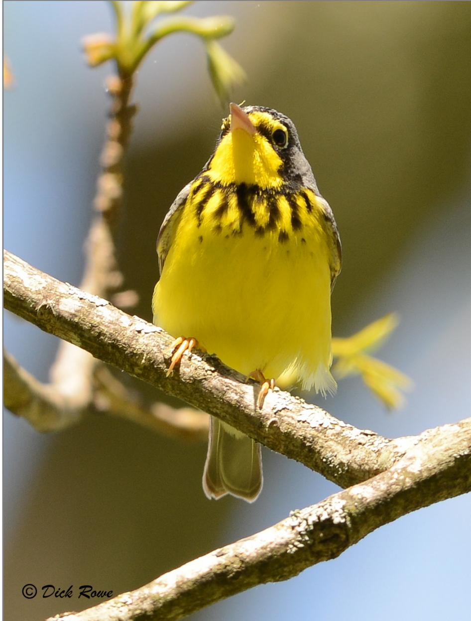
Canada Warbler.