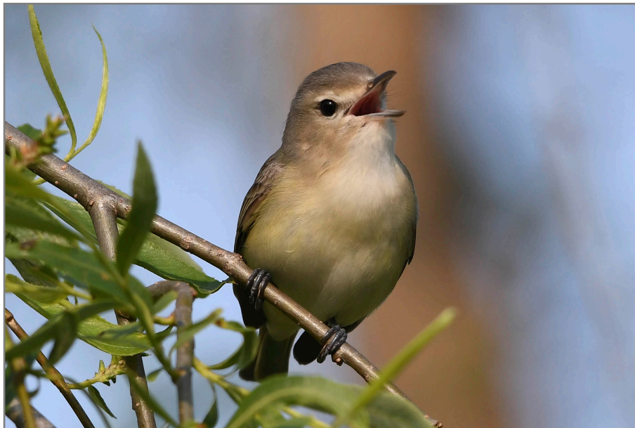
Red-eyed Vireo.